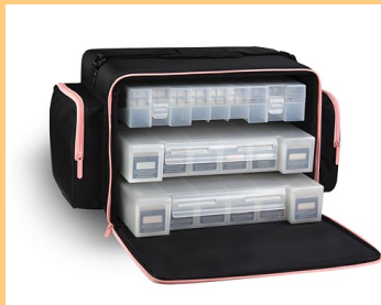
Insulated Color Case

This is a 3-piece Insulated Set used to carry your products and display them. You can store tons of inventory in them and bring it to your skin care classes.