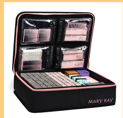
Insulated Lipstick Case