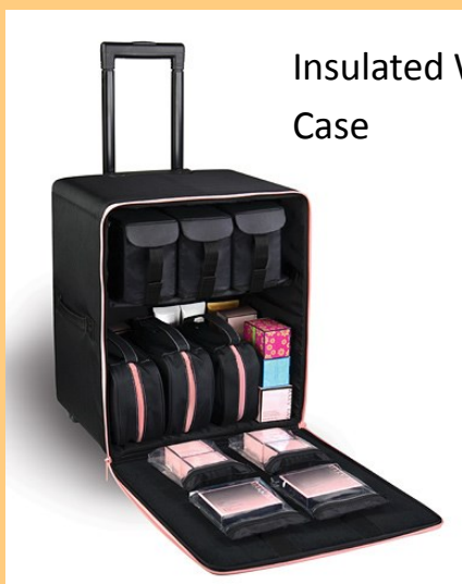
Insulated Wheeled Case