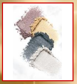
Mineral Eye Color in Four Sparkle Shades