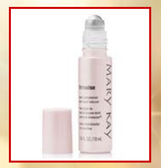
TimeWise® Even Complexion Dark Spot Corrector