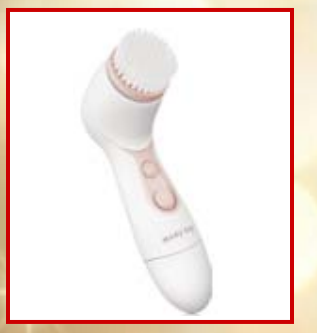
Mary Kay® Skinvigorate™ Cleansing Brush