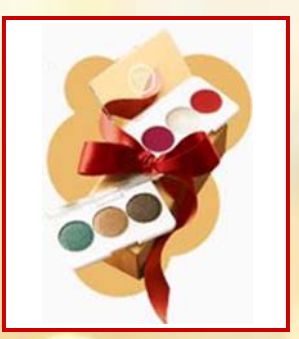
Mary Kay at Play™ Holiday Sets