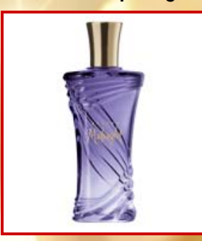
Belara Midnight™ Eau de Parfum