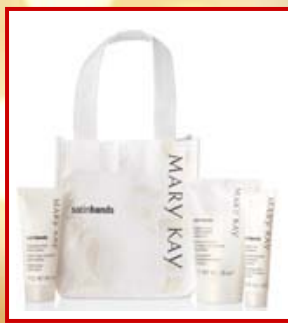
Gift with $40 Purchase - Mini Satin Hands® Pampering Set