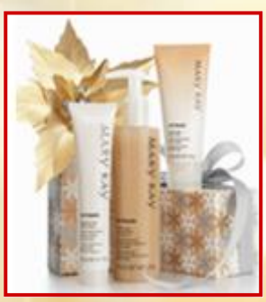
Vanilla Sugar Satin Hands® Pampering Set