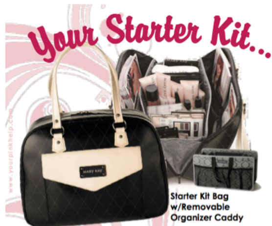
Starter Kit Bag w/Removable Organizer Caddy

Mary Kay is one of the largest direct sellers of skin care and color cosmetics in the world.